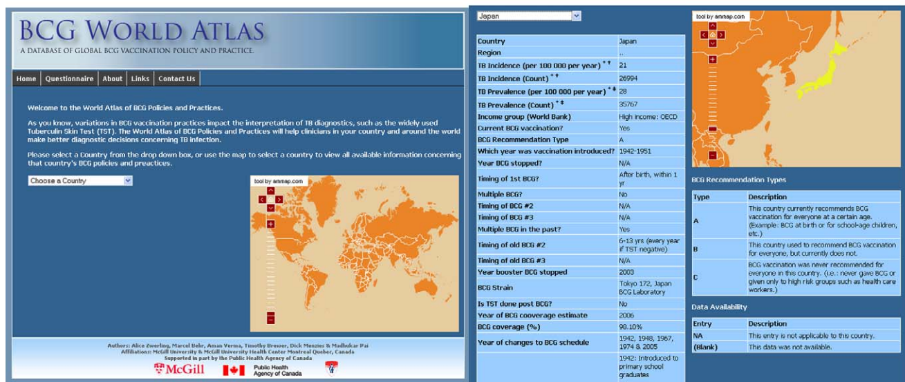
Figure 1. Home page of the BCG World Atlas ( http://www.bcgatlas.org/ ) and example of BCG policies and practices in Japan. doi:10.1371/journal.pmed.1001012.g001

Many countries began BCG vaccination programs in the 1940s–1980s, though some countries such as Romania and Uzbekistan report vaccination campaigns as early as 1928 and 1937, respectively, while some sub-Saharan African nations such as Nigeria and Sierra Leone only began BCG